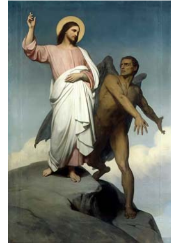
The Temptation of Jesus St. Luke 4:1-13