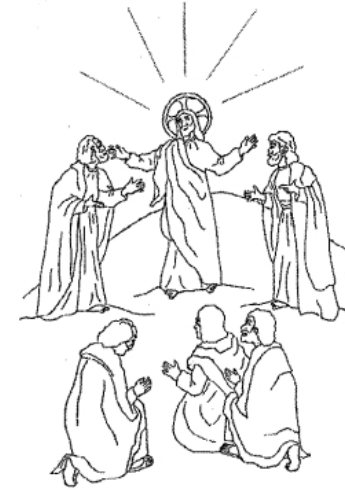
The Transfiguration Luke 9:28-36